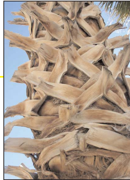
Petioles or Boots

(This also adds to landfill load and waste problems.)