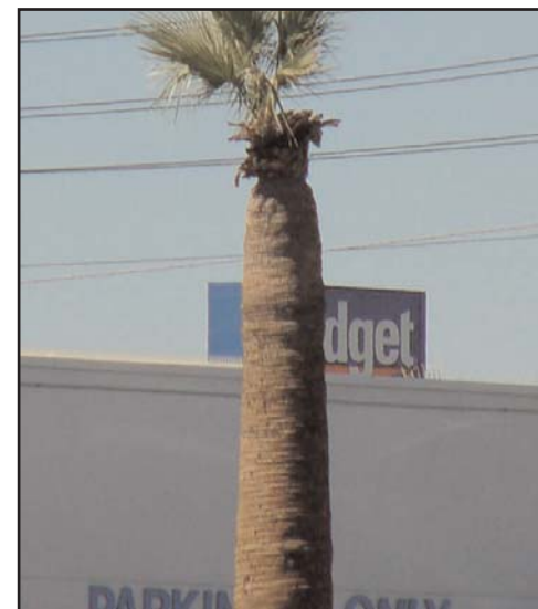
Poor Pruning Practices Create a Pencil Neck Effect of the Trunk