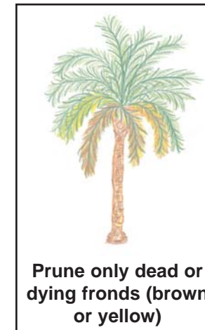
Prune only dead or dying fronds (brown or yellow)