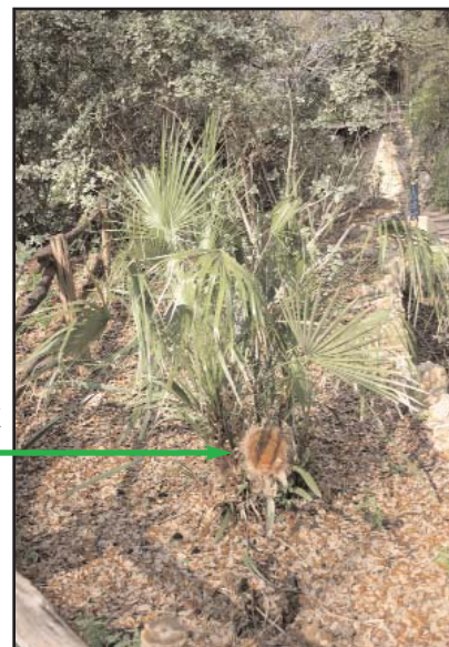
Pruned Off Trunk